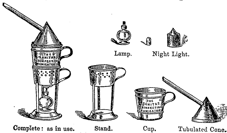
Complete: as in use.